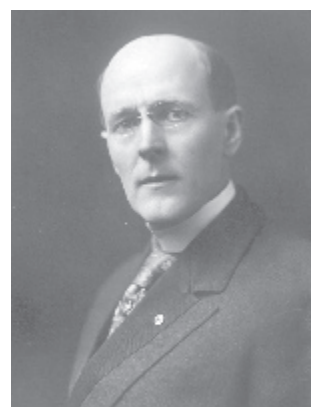
Paul Harris, Founder of Rotary